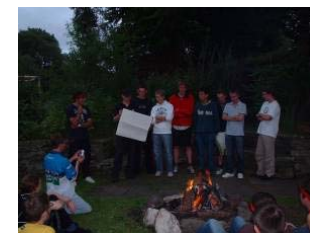
THE LAST NIGHT CAMPFIRE AT RYLA CAMP 2006